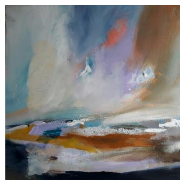
'The Passing Shadow'.