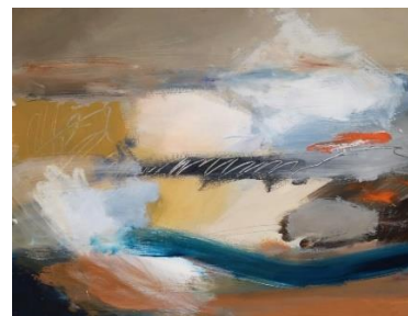
'Horizons of Sand'