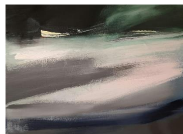
'Night Sweeps In'